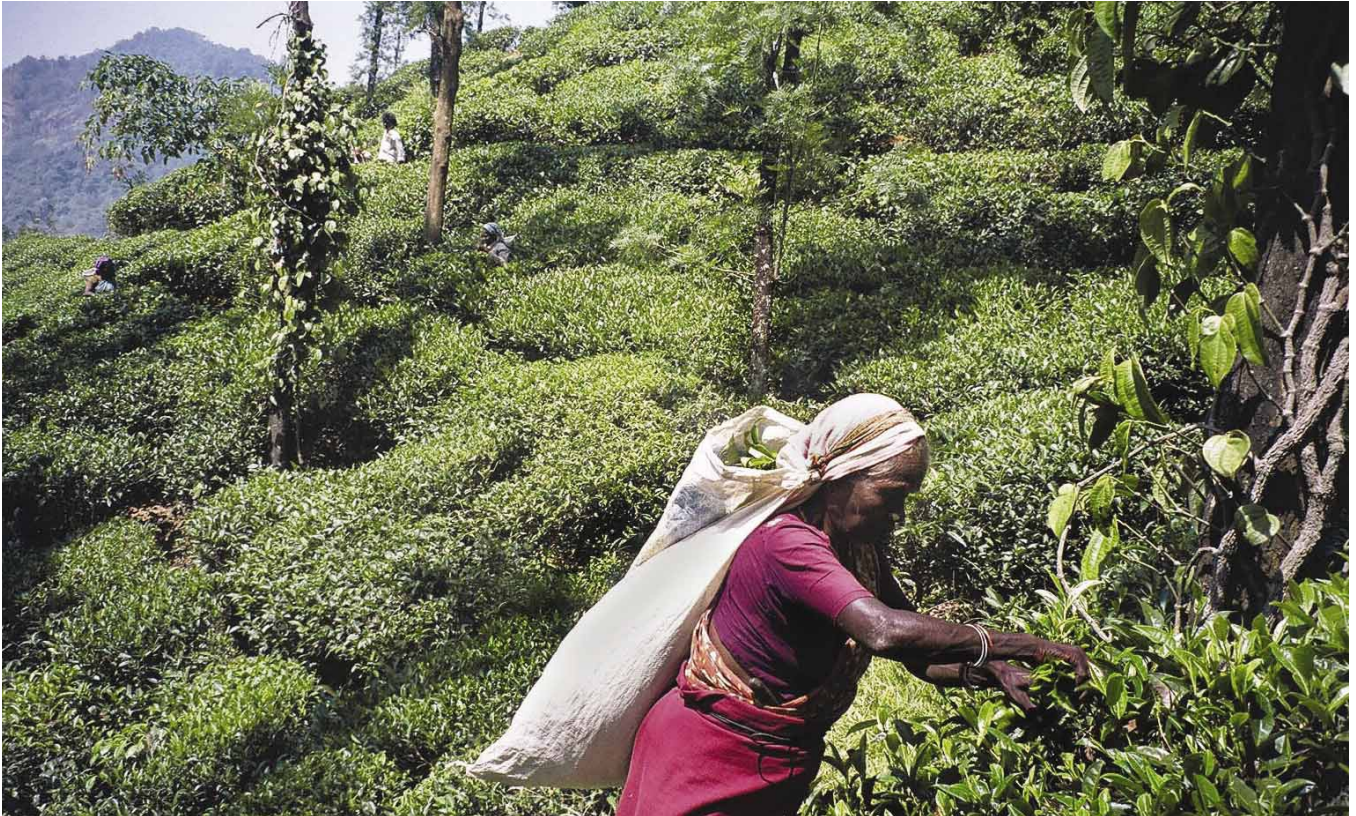
Women workers picking tea in Tamil Nadu, southern India