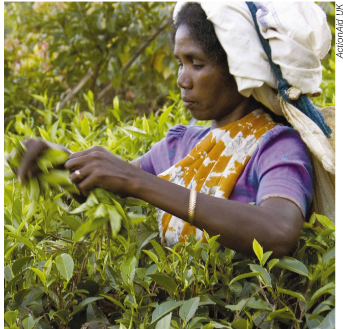
Plantation worker, Tamil Nadu