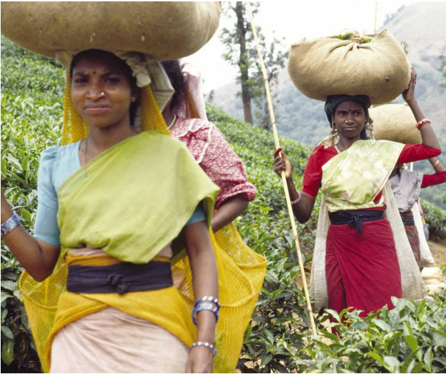
Women tea pickers, Gudalur valley, Tamil Nadu