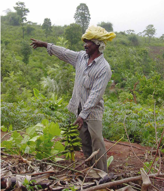
Adivasi villager, Gudalur valley, Tamil Nadu