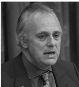
Mark Malloch-Brown Administrator, UNDP

From: “At the Heart of Everything Lies HIV/AIDS,” Statement by Stephen Lewis, UN Special Envoy for HIV/AIDS in Africa: Zambia Test Case for G8 Summit. June 11, 2004