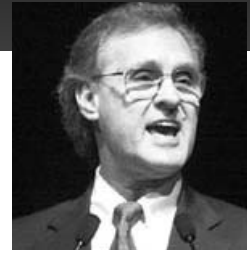
Stephen Lewis, UN Special Envoy for HIV/AIDS in Africa

From: The UN Millennium Project’s January 2005 report, “Investing in Development A Practical Plan to Achieve the Millennium Development Goals” Chapter 3, p. 36