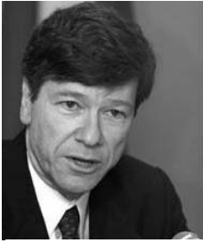
Jeffrey Sachs, Director UN Millennium Project

“International Monetary Fund program design has paid almost no systematic attention to the [Millennium Development] goals when considering a country’s budget or macroeconomic framework. In the vast number of country programs supported by the IMF since the adoption of the goals, there has been almost no discussion about whether the plans are consistent with achieving them...In its country-level advisory work, the UN Millennium Project has found that multilateral and bilateral institutions have not encouraged countries to take the Millennium Development Goals seriously as operational objectives. Many low-income countries have already designed plans to scale-up their sector strategies, but due to budget constraints could not implement them. In other cases, countries are advised to not even consider such scaled-up plans.”