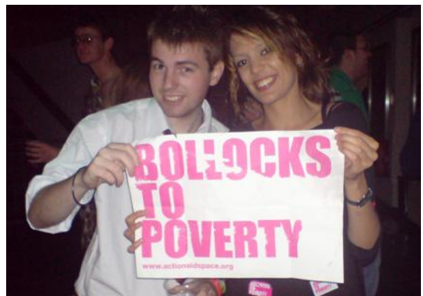
BTP club night at Reading University Student Union