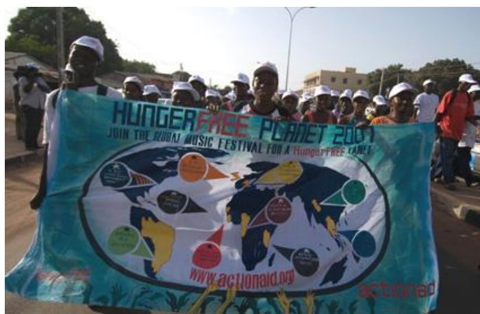
Activists in Gambia organised a rally for the same campaign, where hunger is a daily reality for many. This helped to persuade their government to almost double funding to agriculture, which will help farmers grow more food.