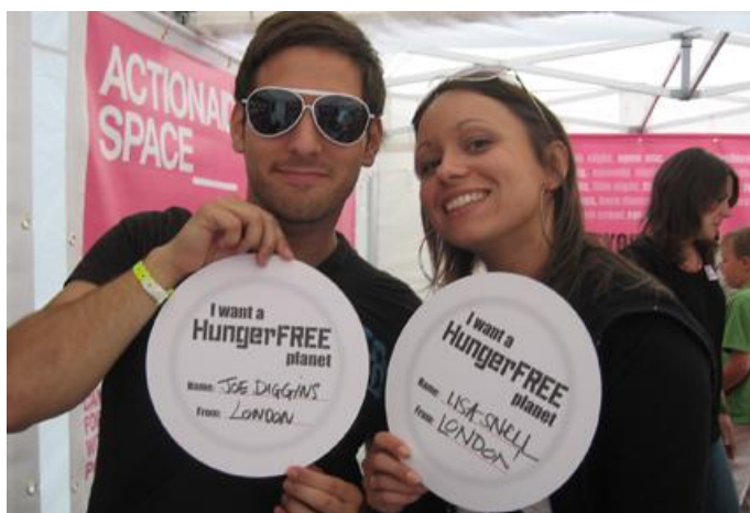
UK festival goers take part in our HungerFREE campaign to demand world leaders keep their promise to halve hunger by 2015.

So we need you to get people aware of the injustices keeping people poor, and taking part in our campaigns to change things. It does work. Find out more about our campaigns.