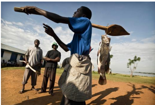
The youth group perform a drama about HIV to fishermen on the beach.

Now people are more open about HIV and infection rates have decreased in her village. Local schools invite the youth group in to educate pupils about safe sex and HIV. They are even in talking to the elders and religious leaders about changing the way they speak about HIV AIDS.