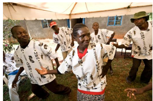
They write songs and create dances to get the village's attention on market days.

While some progress has been made in providing ARV treatment to people with HIV in poor countries, less than half of the people who need life saving drugs are receiving them. ActionAid are campaigning internationally for the UN to keep the promise they made of universal access to treatment by 2010.