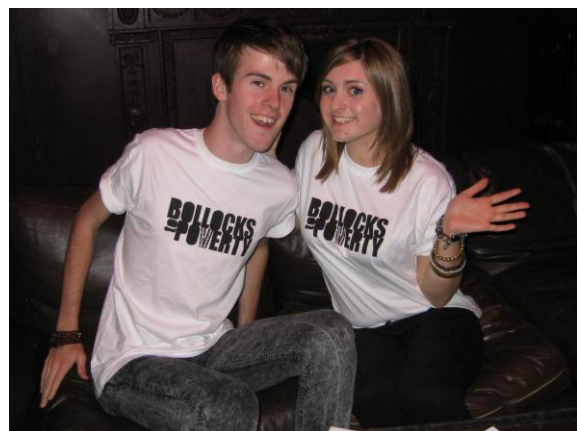
Bollocks to Poverty open mic night at Cardiff University Student Union