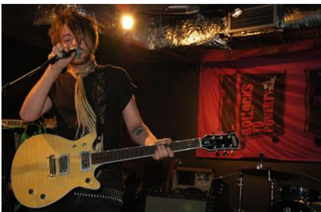
Bollocks to Poverty gig at The Legion, London

All of the above, plus raise some money for ActionAid too! Your cash will help fund a vital project to get more children an education in Haiti where the recent earthquake has destroyed many school buildings. We can provide collection boxes and fundraising advice.