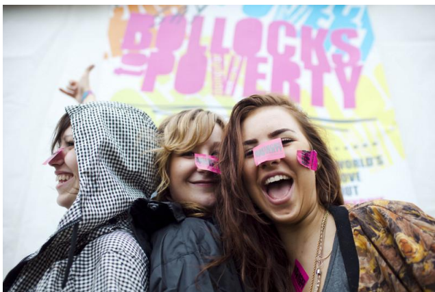
How long will I have to be at the festival for?