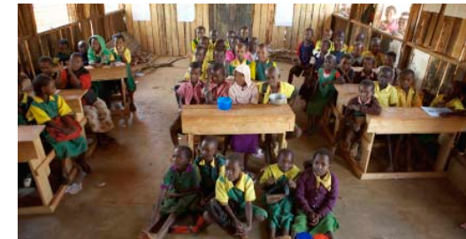
A crowded classroom in Emengan primary school, Isiolo, Kenya.