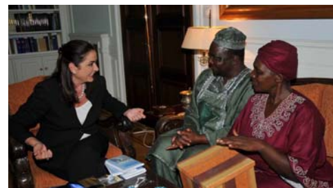
At the Ministry of Foreign Affairs