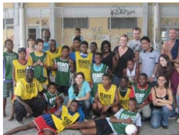
Children's football team with ACTIVISTA coordinators.

During the meeting, the group visited ActionAid's partner CEEAAC in the City of God where they also had the chance to meet field workers and play with the children.