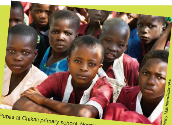
Pupils at Chikali primary school, Nsanje.

We will send you messages and photos from the schoolchildren in Nsanje with our feedback report.