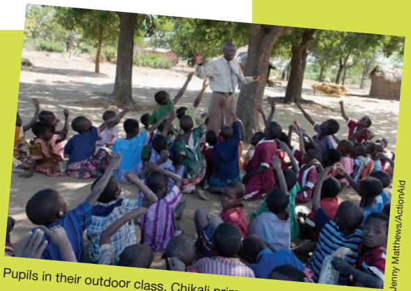
Pupils in their outdoor class, Chikali primary school, Nsanje.

Visit www.actionaid.org.uk/sukulumalawi/donate and you can pay in any funds you have raised, or make a donation using a credit or debit card.