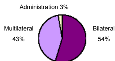
Figure 1: DFID Aid expenditure by channel in 2002/2003 10

Two relatively new forms of channelling funding are through PPAs and DBS. PPAs are strategic agreements typically lasting 3-5 years whereby DFID provides funding to UK based civil society organisations (CSOs) for work related to achievement of the Millennium Development