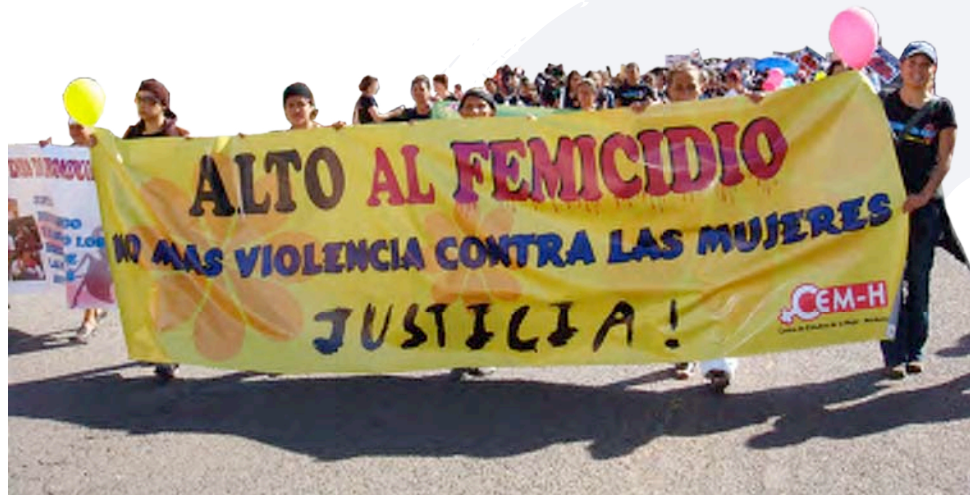
Every 25th November women's organisations take part in the International Day for the Elimination of Violence Against Women march (Tegucigalpa, Honduras).

way to go. Violence against women and girls is entrenched in gender inequality, and whilst unequal power relations exist between women and men, women will always be susceptible to violence.