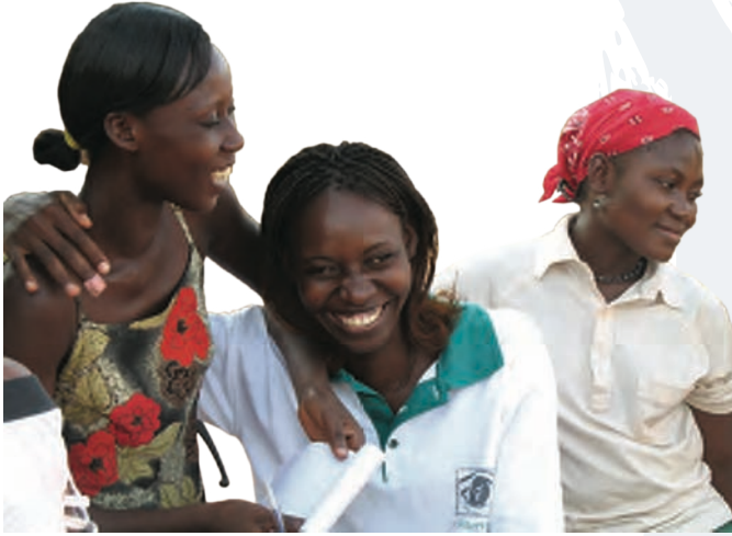
Young women and girls, part of a Gender & HIV awareness programme (Burkina Faso).