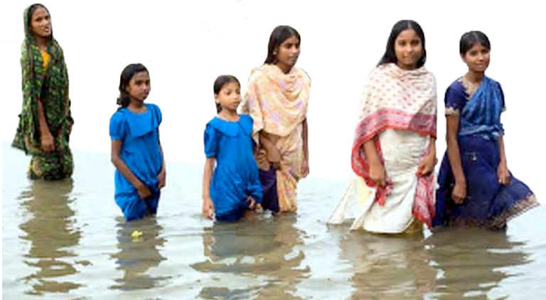
Village of Char Harikesh, Kurigram District, Bangladesh.

Violence against women and girls is both a cause and consequence of inequality between men and women. The cause of violence is the subordination of women by men throughout history. Through violence, power and control over women is maintained. During times of social breakdown or crisis, gender inequalities and discrimination are often exacerbated and more easily exploited by those in power.