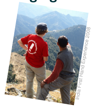
India First Hand Experience 2008

Climb a mountain or trek through a rainforest. We have projects in over 40 countries in Africa, Asia and the Americas so let us know before hand and we might even be able to show you one of our projects whilst your out there!