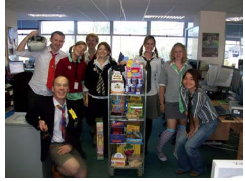
ActionAid Fundraising Team - Hamlyn House

ActionAid Staff transformed the ActionAid offices into an 80's tuck shop for the day raising over £350. We had 80's style sweets and treats plus school dinners, cheesy pop, conkers and we even popped our Director of Fundraising into a school uniform!