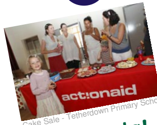
Cake Sale - Tetherdown Primary School

A timeless classic that never fails... Why not get yourself a free stall at your local market or take a trip round your local churches, youth groups and community centres.