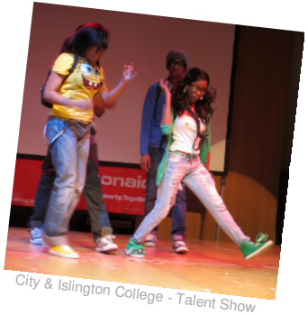
City & Islington College - Talent Show