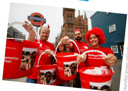
ActionAid street collection - King's Cross