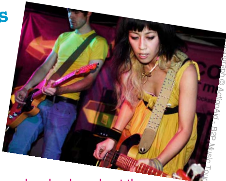
22P Music, 7, 011

Organising a gig can be great fun. Scout out your local talent and talk to your favourite venue to get things started! Mix it up with a battle of the bands at college or work!