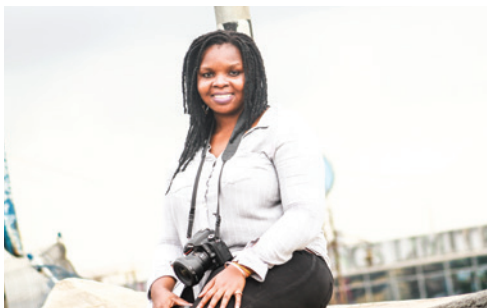
Nigerian Photographer Etinosa Yvonne

If you are able, we hope you'll come and experience these impressive and diverse works for yourself. Seen up close and in person, they have a power that is hard to deny. •