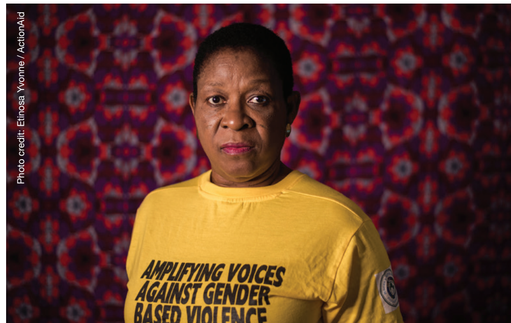
Bose is the founder of a grassroots organisation supporting women experiencing gender based violence in Nigeria.