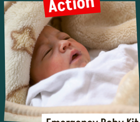
Emergency Baby Kit