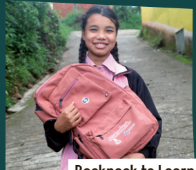
Backpack to Learn