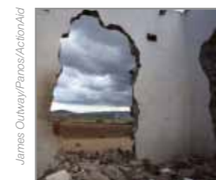
A demolished house near Ga-Puka.

The mine’s right to conduct operations on the Sandsloot farm derives from a mining right issued to it by the Department of Minerals and Energy. But the lease agreement allowing the company to occupy the farm, and indeed the relocation agreement to move the villagers from Ga-Pila to Sterkwater, have never been seen by the community. Villagers did not know by what right the company was able to occupy the Sandsloot farm, relocate the villagers and destroy much of the village. ActionAid’s information is that at the time of the relocation the community believed that Anglo Platinum had a right granted by the state to carry out mining operations in Ga-Pila village and that they had no choice other than to relocate (see box 5). 30