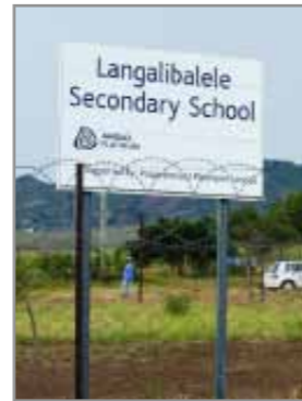
Langalibalele secondary school, Ga-Molekane