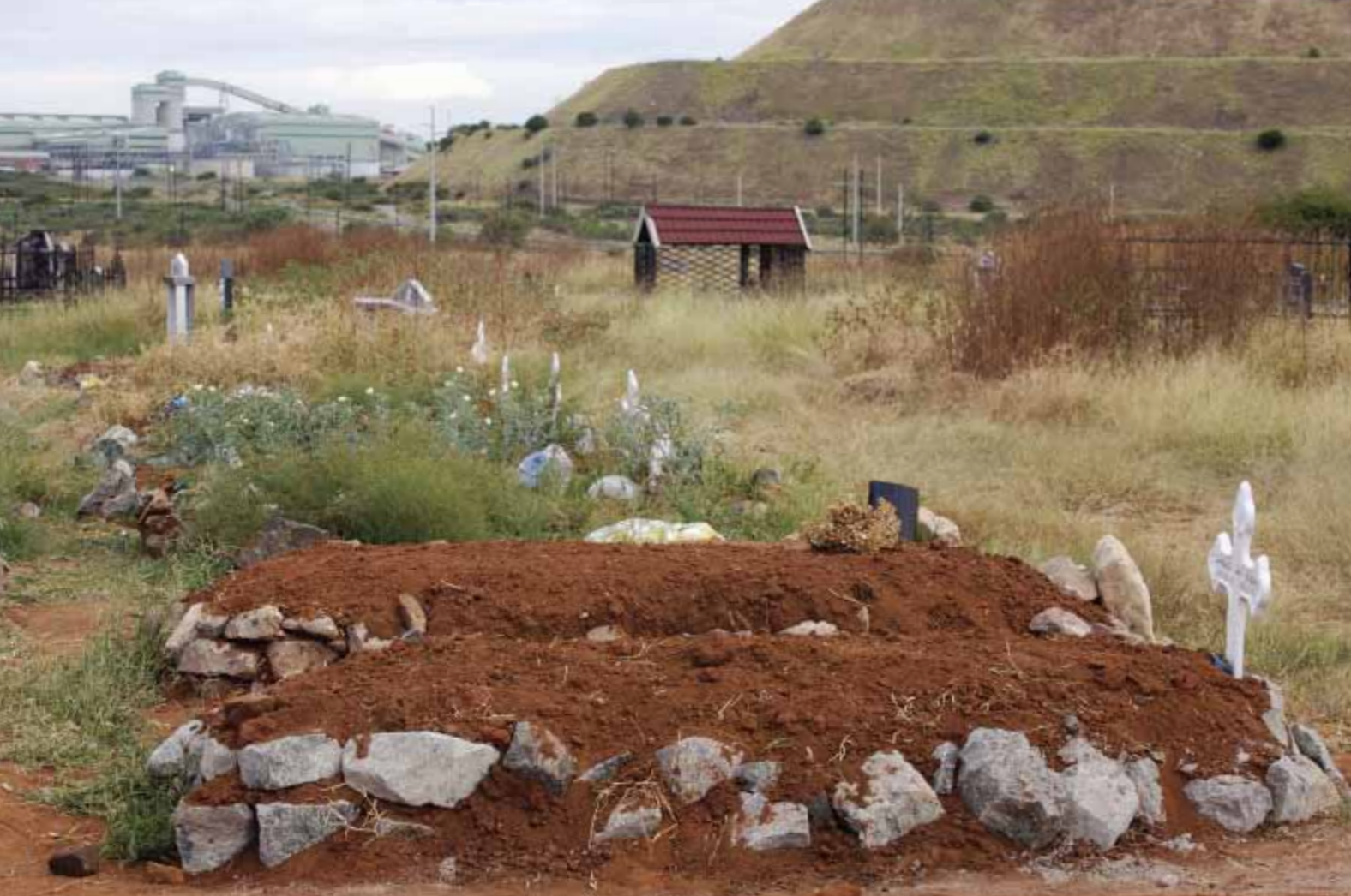
Graves have been relocated to make way for the mine at Ga-Pila village