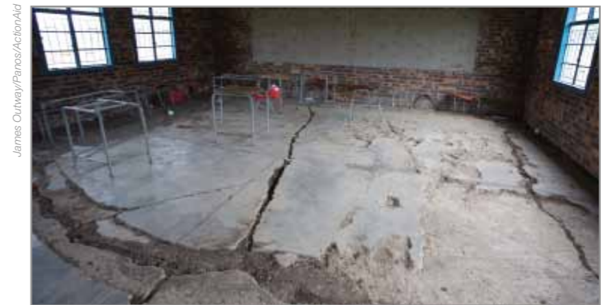
Marole secondary school in Maandagshoek.