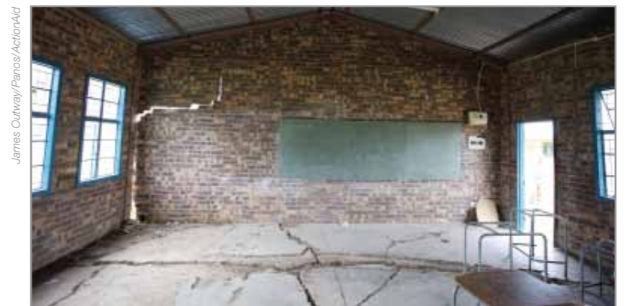
Marole secondary school in Maandagshoek.