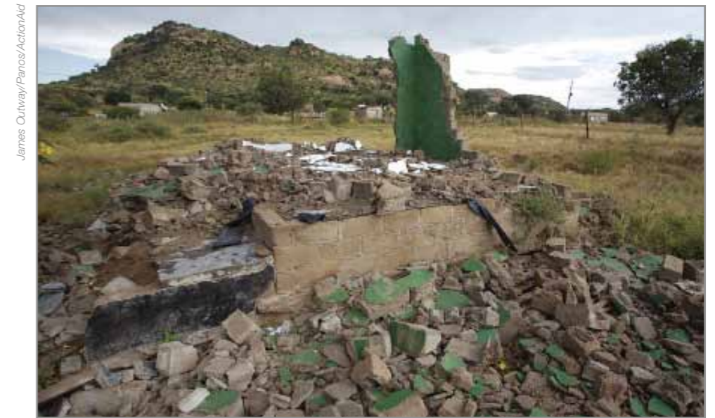
One of the demolished houses in Ga-Puka from where many people have been relocated. The mine wants to use the land as a dump.

"One village might say yes, and three others might say no." Dept of Minerals