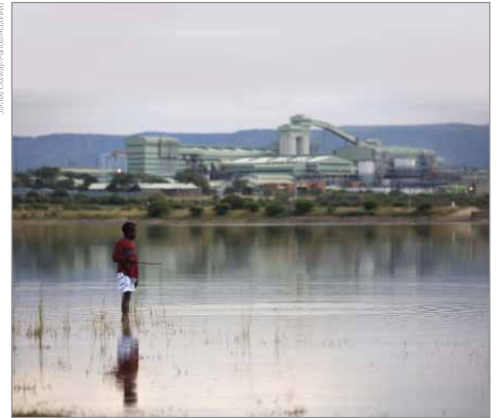
A boy fishes in Ga-Molekane village, near the PPL mine.