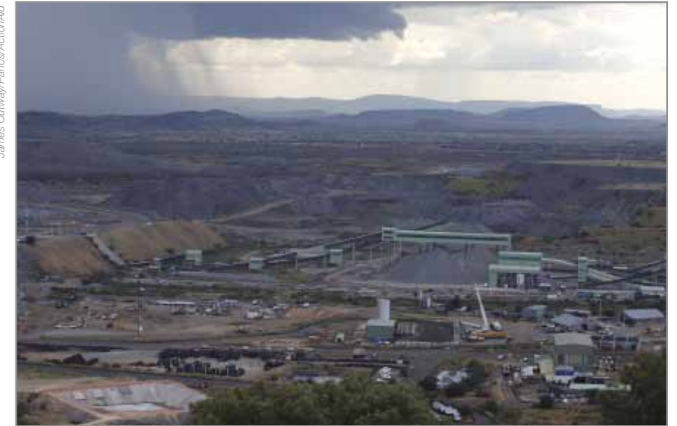
The PPL mine.