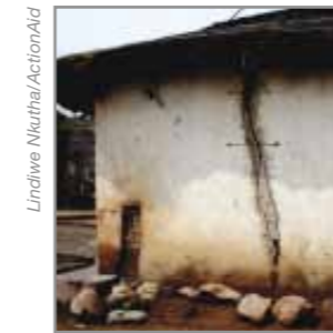
House with cracks. Ga-Molekane.

The average food bill for a family is now around R6,000 (£428) more each year