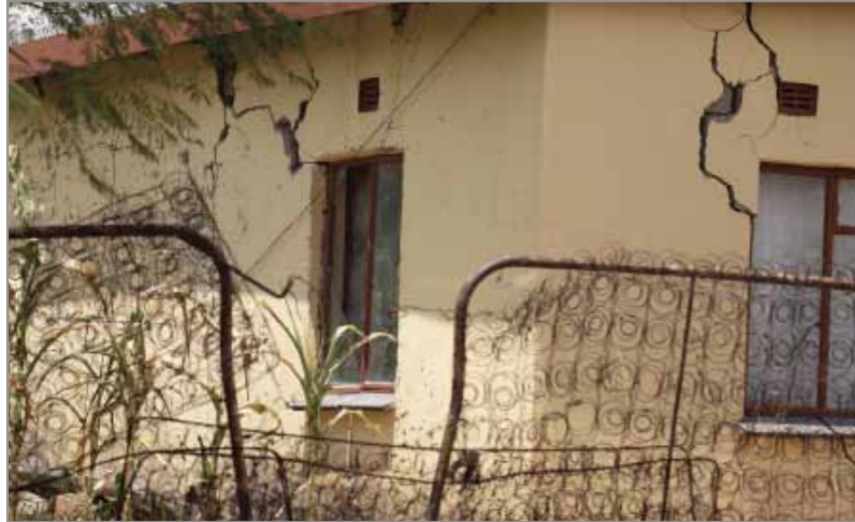
Cracks have appeared on some of the houses in Ga-Pila village.