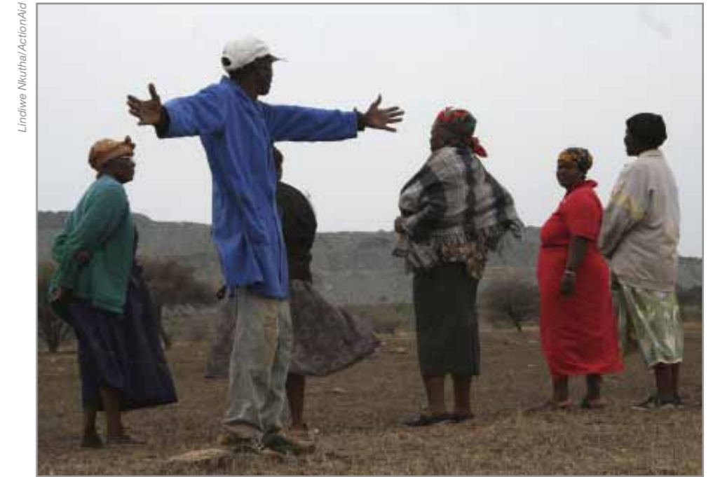
Ga-Pila residents looking at mining waste.

R5,000 per family compensation was a tiny sum