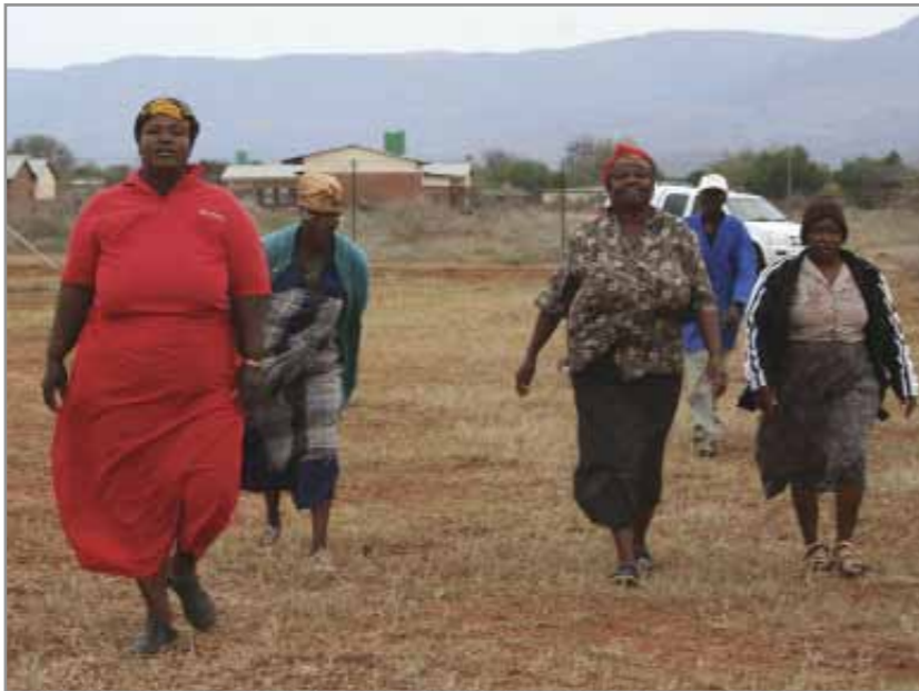
Women of the Limpopo without farmland.

Women and especially female-headed households, of which there are many in Limpopo, derive their independence from men from their ability to farm and often to earn an income from selling their surplus. Loss of land due to mining means loss of income and means of independence. In turn, this can directly affect the nutrition status of children, and thus children's education.