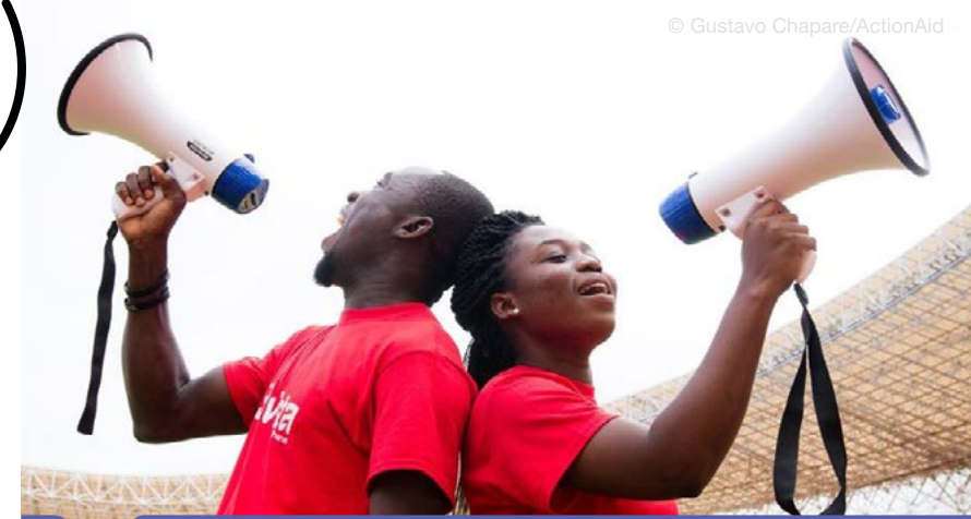
The launch of the ActionAid Ghana Activista network.

ActionAid is an international charity that works with women and girls living in poverty. Our dedicated local staff are changing the world with women and girls. We are ending violence and fighting poverty so that all women, everywhere, can create the future they want.