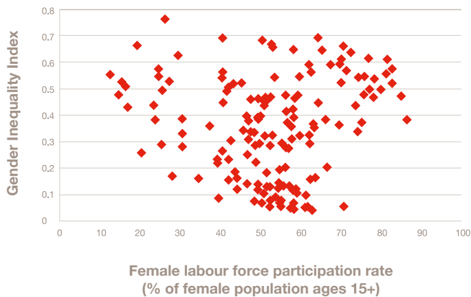
Figure 3. No given link between female labour force participation and gender inequality more broadly