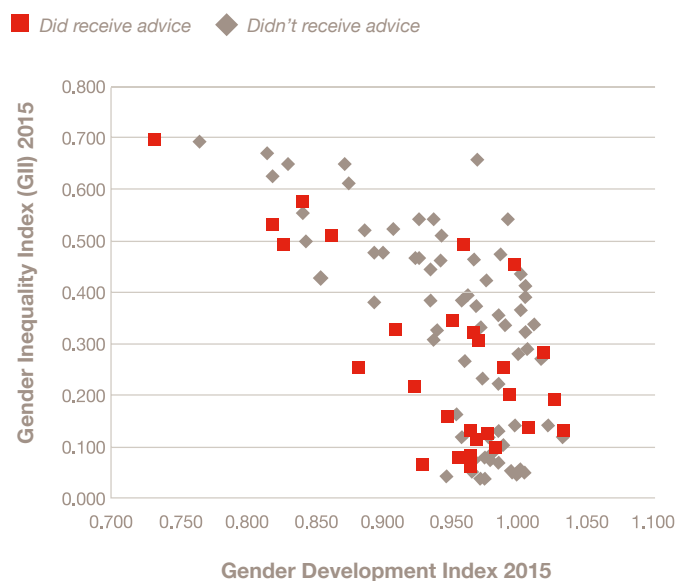
Figure 2. Gender inequality levels of jurisdictions that did and didn't receive advice to increase female labour force participation compared

Note: Estimates of each of the 124 countries' levels of gender inequality and gender development is displayed, where the colour of the indicator displays whether advice to increase female labour force participation was provided by the IMF in the 2016 surveillance reports. Data source: Author's analysis of publicly available Article IV 2016 reports and UNDP data.