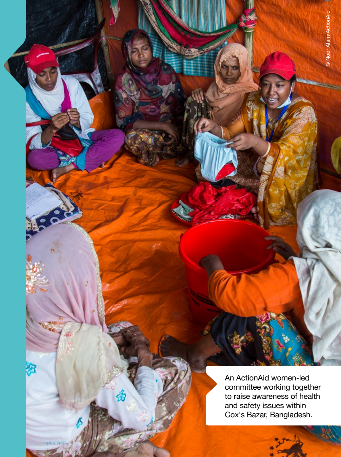
An ActionAid women-led committee working together to raise awareness of health and safety issues within Cox's Bazar, Bangladesh.

The support provided through the Ambassador Network meant that we could provide over 50,000 refugees with immediate food, water and shelter materials. When women and girls told us that there were no private toilets or washing spaces and that they felt unsafe to use the few facilities that did exist at night, we built 50 female toilets and 20 private bathing spaces, powered by solar panels.